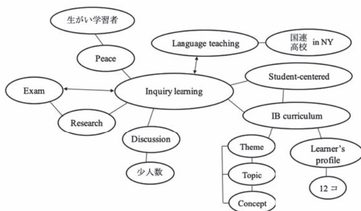
Figure 3. Conceptual map (Participant C)